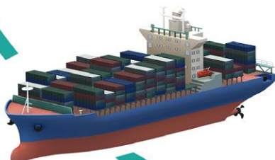
TRANSPORTATION & LOGISTICS