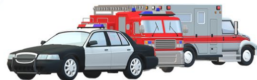
PUBLIC SAFETY & EMERGENCY SERVICE

Built to meet the heightened needs of industry clients, Durabook's unmatched rugged product lineup has everything you need.